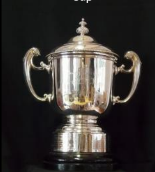
The Queen Mary Cup