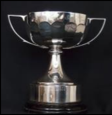
The Kilbee Stuart Cup