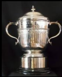
The Cant Cup