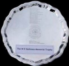
The W E Harkness Memorial Trophy