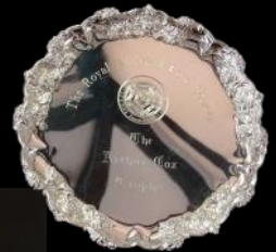
The Arthur Cox Trophy