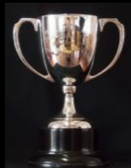
The Bank of England Cup