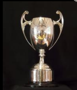
The Gardeners Company Cup

2014 Schedules Produced by RNRS Shows Committee Registered Charity No. 1035848