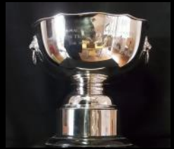
The Frank Bowen Trophy