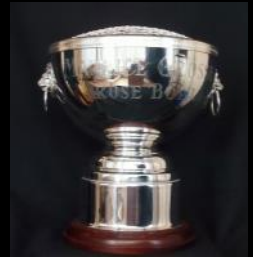
The Maurice Gross Rose Bowl