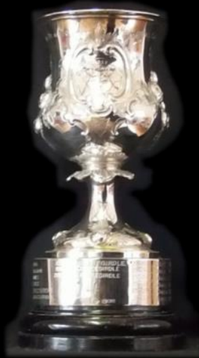
The Dean Hole Cup